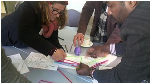
Designing a floating home at our Humanitarian Design & Engineering and STEM workshop on the 20th July